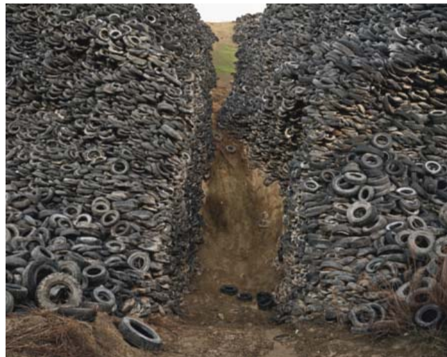
Edward Burtynsky Canadian, b. 1955 Oxford Tire Pile #8, Westley, California. In Manufactured Landscapes, 2003 Chromogenic color print, 48 x 60 in, 121.92 x 152.4 cm

My media-blasted students, born head-on into the environmental crisis, may cling to the memory of a family vacation to Yosemite, yet they also take the polluted earth as a given. As I continue to project images of that difficult certainty, I see their attraction-turned-to-repulsion trigger a range of reactions, from a resigned shrug of the shoulders to a boiling-mad look on their faces. My ploy as a teacher may emulate environmentalist author Terry Tempest Williams, writing about the work of Gowin, who pointedly asks: “Do we now dare to look ourselves in the eye and begin the necessary work of repentance and restoration?” 8